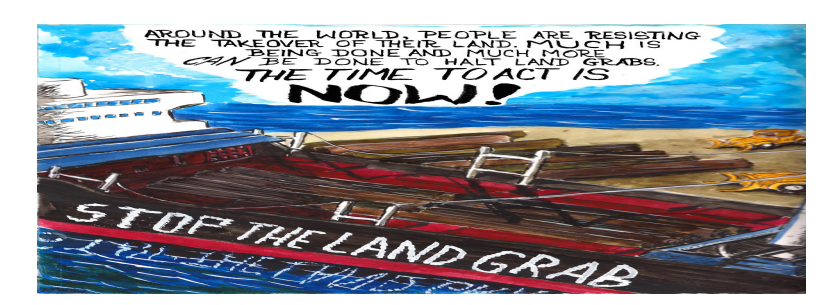
Figure 6. The Oakland Institute (2015).

less secure land rights. The arguments of opponents of land leasing, such as those outlined above, enjoy a notable degree of cultural resonance with those African communities directly experiencing the effects of these new land deals, but also internationally amongst those who stand in solidarity with the people of Africa (e.g., Climate Justice Assembly Declaration, The World Social Forum, 2009). Of particular concern are those procedures that systematically block the democratic freedoms of communities to change the course of resource destruction and resist an unwanted degree of capitalist domination of their ecological and economic fate (see the Oakland Institute, 2015). Securing freedom from such domination requires action. Figure 6 below presents an illustration by the Oakland Institute designed to inspire publics to act by evoking familial memories of colonial ships transporting precious cargo out of Africa. The aim here is to trigger historical recognition and mobilize communities to support collective campaigns of solidarity to stop contemporary 'land grabs' across the developing world.