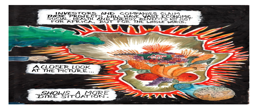
Figure 5. The Oakland Institute (2015).

For ChristianAid (2013, p. 16) also, a deeper understanding of the significance of land to the communities of Africa is essential. This actor notes a major tactic of the World Bank is to systematically ignore evidence supporting the virtues of small-scale farming. Instead, large-scale farming tends to be presented as the only option for the future. Figure 5 below presents an illustration by the Oakland Institute where the dangers of this push for larger scale intense framing initiatives are graphically portrayed, including an alarming deterioration in the quality of Africa's agricultural lands and a grave depletion of essential water supplies. The image suggests that foreign investors' promise of 'opportunity' hides a deeper, more disturbing truth.