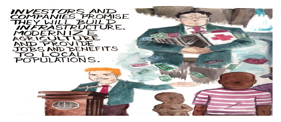
Figure 4. The Oakland Institute (2015)