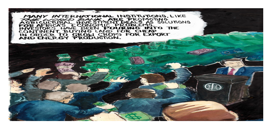
Figure 3. The Oakland Institute (2015)

The protest images below offer some insight into how opponents of land grabs emotionally and thematically anchor these developments. In Figure 3, the scramble for Africa's fertile lands is graphically illustrated, with crowds of US and European investors rushing to buy cheap lands as World Bank officials look on. All are strategically represented as white businessmen, drawing attention to the racial and gender aspects of this dispute.