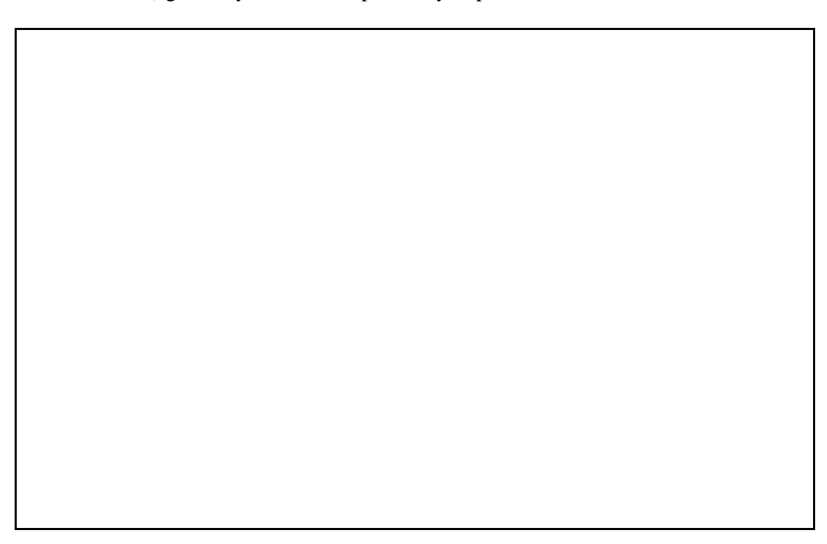
Figure 1 Public and official estimates of % change in frequency of seven offences between 1988 and 1993.

(consensual underage sex). Cannabis dealing, where the increase in the official figures is suspicious, was also excluded although it would have strongly supported the argument made below. For the other seven offences, it was possible to make some realistic estimate of the actual change in offence prevalence. For the official figures, the rate given in 1988 was taken as 100% and the contemporary rate (1993) estimated as a percentage of this. For the public estimate, 6 was the score given to respondents as the rate 5 years ago. Following Davis (1952), every change by one point from 6 was taken as representative of a 10% change. As can be seen in figure 1, there was no relationship between the public estimates and the official figures for the seven offences. This is despite the fact that the Likert scale interpretation of the degree of change (which was constrained by the use of Davis' formula) generally flattered the proximity of public estimates.