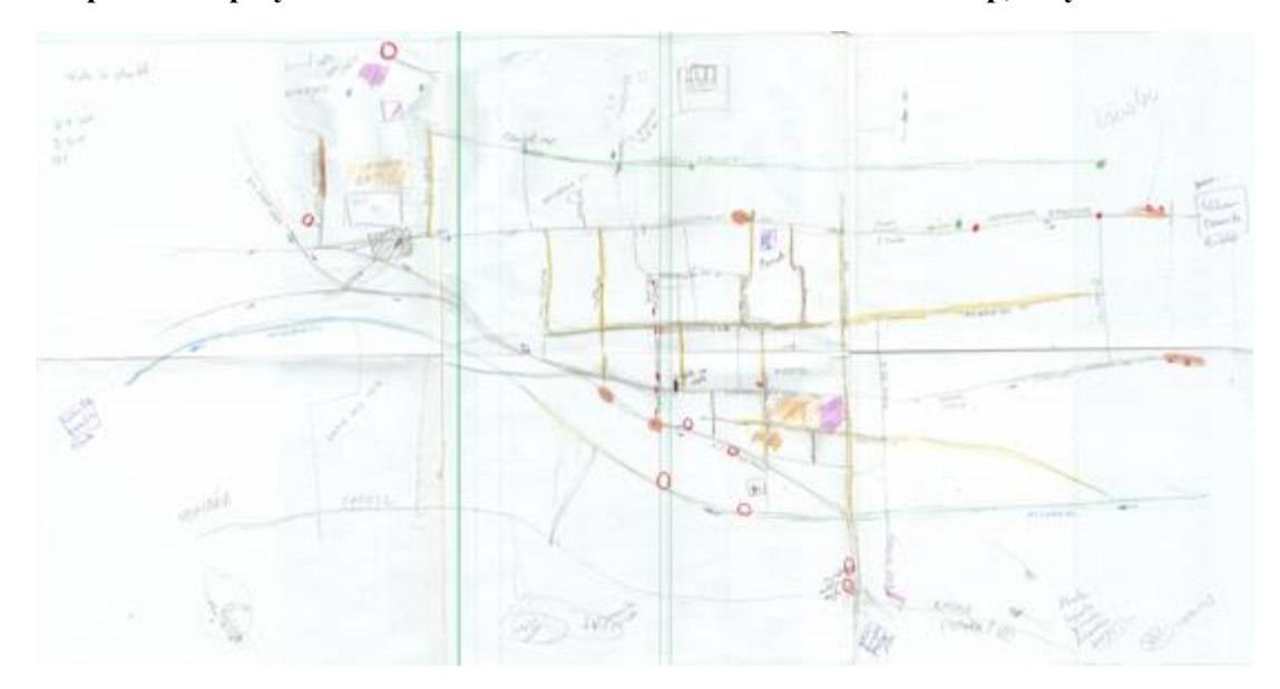
Figure 7. Map drawn up by residents at the Mexico Poniente Avenue workshop, July 2022<sup>20</sup>