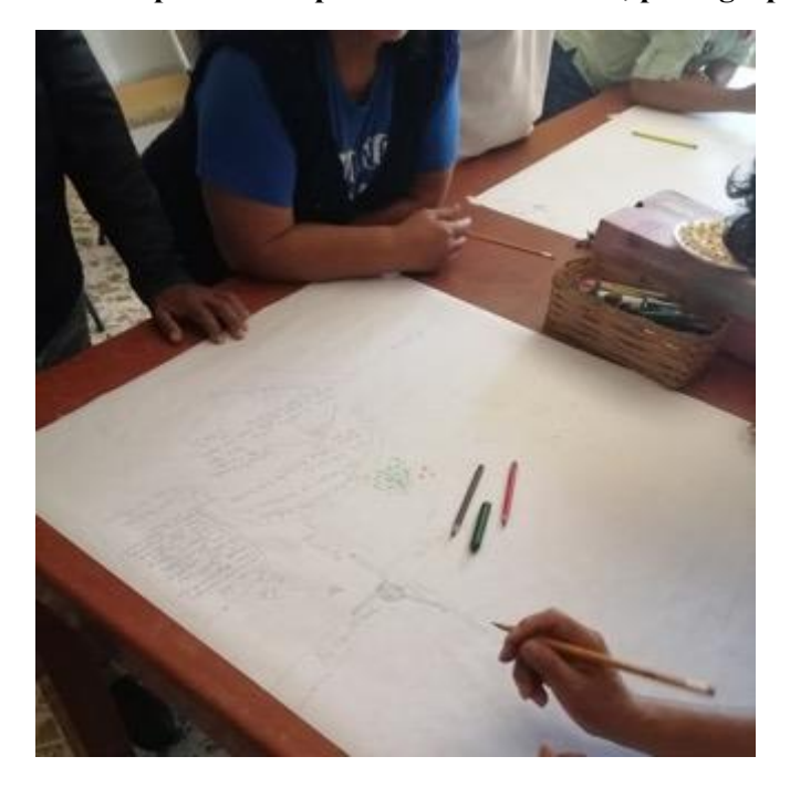
Figure 2. Workshop in the chapel of San Juan Minas, April 2023

As I explained, the maps were not the final product of the workshops, and it was mainly the discussions between the residents (recorded and combined with my own notes) that provided the basic material for my work. My notes and transcripts, accompanied by a field notebook, were broken down thematically around several entries (reference to sociability practices and their locations; references to memories; references to 'new residents' and differentiation criteria, etc.). These themes were not established in advance but emerged inductively during fieldwork.