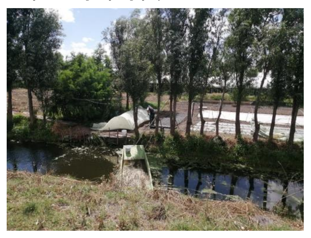
Figure 1. Chinampa de San Gregorio, photograph by the author, June 2023

My involvement in San Gregorio began with a conversation with a member of the 'traditional authority' of the pueblo ,<sup>6</sup> who told me of her desire to stimulate resident activism around the issue of pedestrian mobility, which she felt had become impractical in the context of uncontrolled urbanisation. We agreed to organise workshops with local residents, based on collective production of mental maps, with the aim of arriving at a diagnosis of the problems associated with local walking, which could then serve as a basis for reflection on potential solutions for implementation. I quickly realised that the issues of 'walkability', which were the subject of these workshops, raised much wider questions linked to the eco-territorial claims mentioned above, and that the preservation of a 'local identity' was a recurring theme.