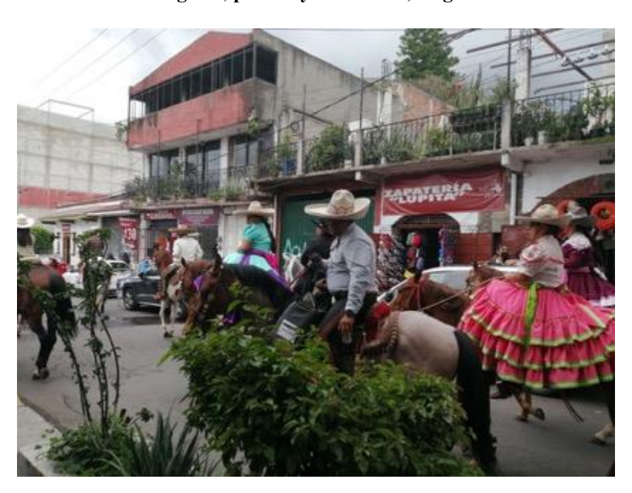
Figure 10. Riders in San Gregorio, photo by the author, August 2022<sup>23</sup>

claim to a pueblo identity, based on historical roots in a territorialised community, gives residents a renewed sense of dignity in the face of metropolitan expansion taking place against a backdrop of dispossession and cultural imperialism.