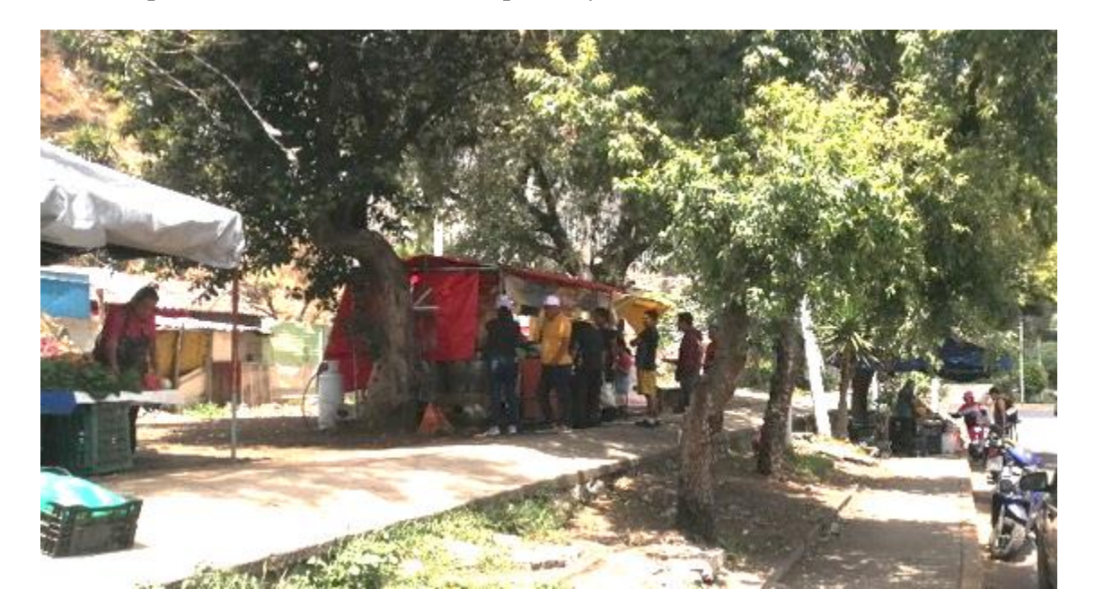
Figure 8. Itinerant puestos on Avenida Acuaducto, photo by the author, June 2023

Observation of daily interactions also shows that 'nativos' and 'new residents' get to know each other, greeting each other, exchanging ideas and forging ties of varying strength: a relationship of 'public familiarity' (Blokland, 2017; Felder, 2021) is established. Finally, the ordinary conflicts associated with the practice of walking are managed and negotiated on a daily basis, without the categorisations into 'native'/'newcomer' necessarily being applied, which suggests that these distinctions operate mainly at the discursive level.