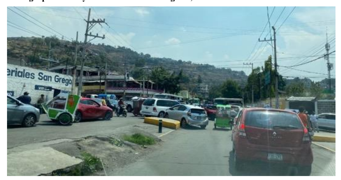
Figure 6. Photograph taken by a resident of San Gregorio, June 2023.

This feeling of 'deterritorialisation' means that San Gregorio, as an emotionally charged place and a source of identification, seems less and less habitable to its inhabitants, with its capacity for both material and ideal 'appropriation' limited. One of the discursive tools frequently used by local residents is that of nostalgia: the route they took as children to visit their parents' fields or to go for a walk is now closed off by urbanisation or by insecurity. Numerous studies have looked at the use of nostalgia in contemporary cities, which are undergoing sometimes brutal changes (Colin et al., 2019; Gervais-Lambony, 2003; Guinard & Gervais-Lambony, 2016; Portal, 2022). Nostalgia produces communality in the sense that it reaffirms shared symbols, even after their physical presence has disappeared, and is also of protest against an unjust urban order.