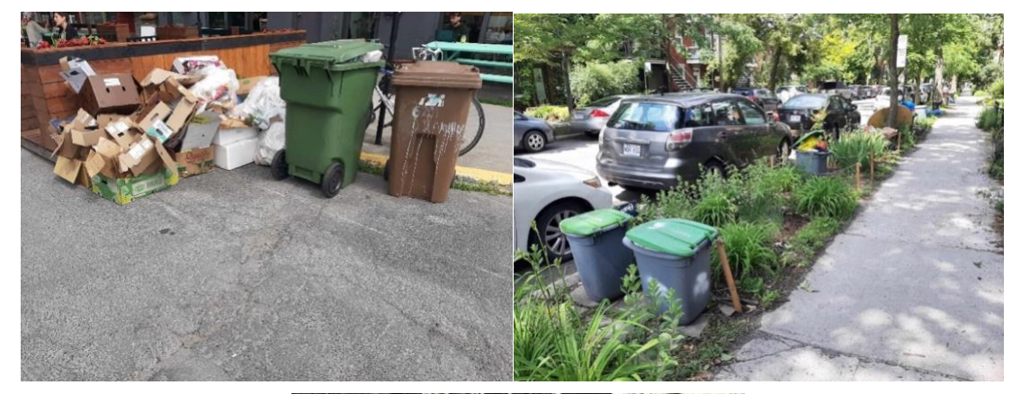
Figure 2. Photos taken in the Villeray—Saint-Michel—Parc Extension and Plateau—Mont-Royal boroughs

blue bags). Here, garbage collectors must cross parking spaces and sidewalks (often icy in winter) to reach the waste.