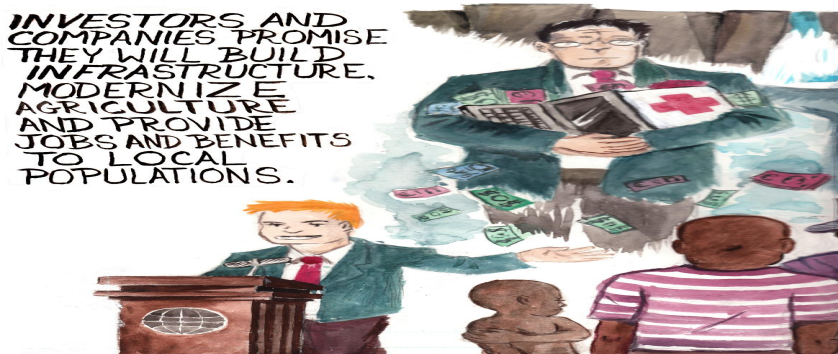
Figure 4. The Oakland Institute (2015)