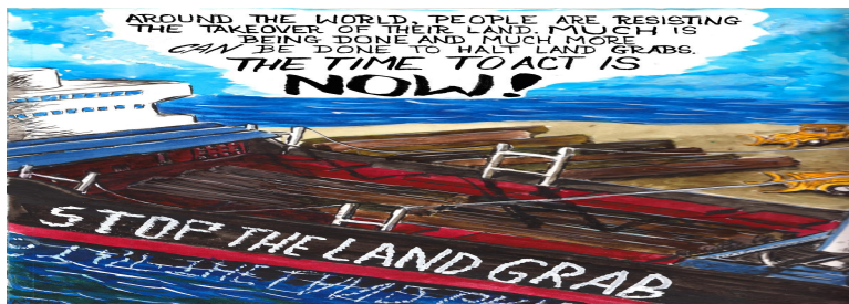
Figure 6. The Oakland Institute (2015).

less secure land rights. The arguments of opponents of land leasing, such as those outlined above, enjoy a notable degree of cultural resonance with those African communities directly experiencing the effects of these new land deals, but also internationally amongst those who stand in solidarity with the people of Africa (e.g., Climate Justice Assembly Declaration, The World Social Forum, 2009). Of particular concern are those procedures that systematically block the democratic freedoms of communities to change the course of resource destruction and resist an unwanted degree of capitalist domination of their ecological and economic fate (see the Oakland Institute, 2015). Securing freedom from such domination requires action. Figure 6 below presents an illustration by the Oakland Institute designed to inspire publics to act by evoking familial memories of colonial ships transporting precious cargo out of Africa. The aim here is to trigger historical recognition and mobilize communities to support collective campaigns of solidarity to stop contemporary 'land grabs' across the developing world.