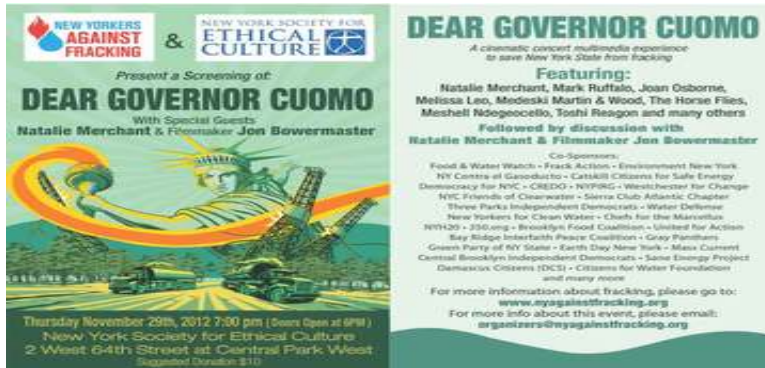
Figure 1. New York Society for Ethical Culture November 2012 (see: http://www.meetup.com/Ethical-Culture-NYC/events/91097922/ ).

heroism in its descriptions of the dangers a 'frack attack' poses to the environment, health, and democratic values of America's communities (see Ecowatch, Stop the Frack Attack National Convention, October 3-5, 2015).